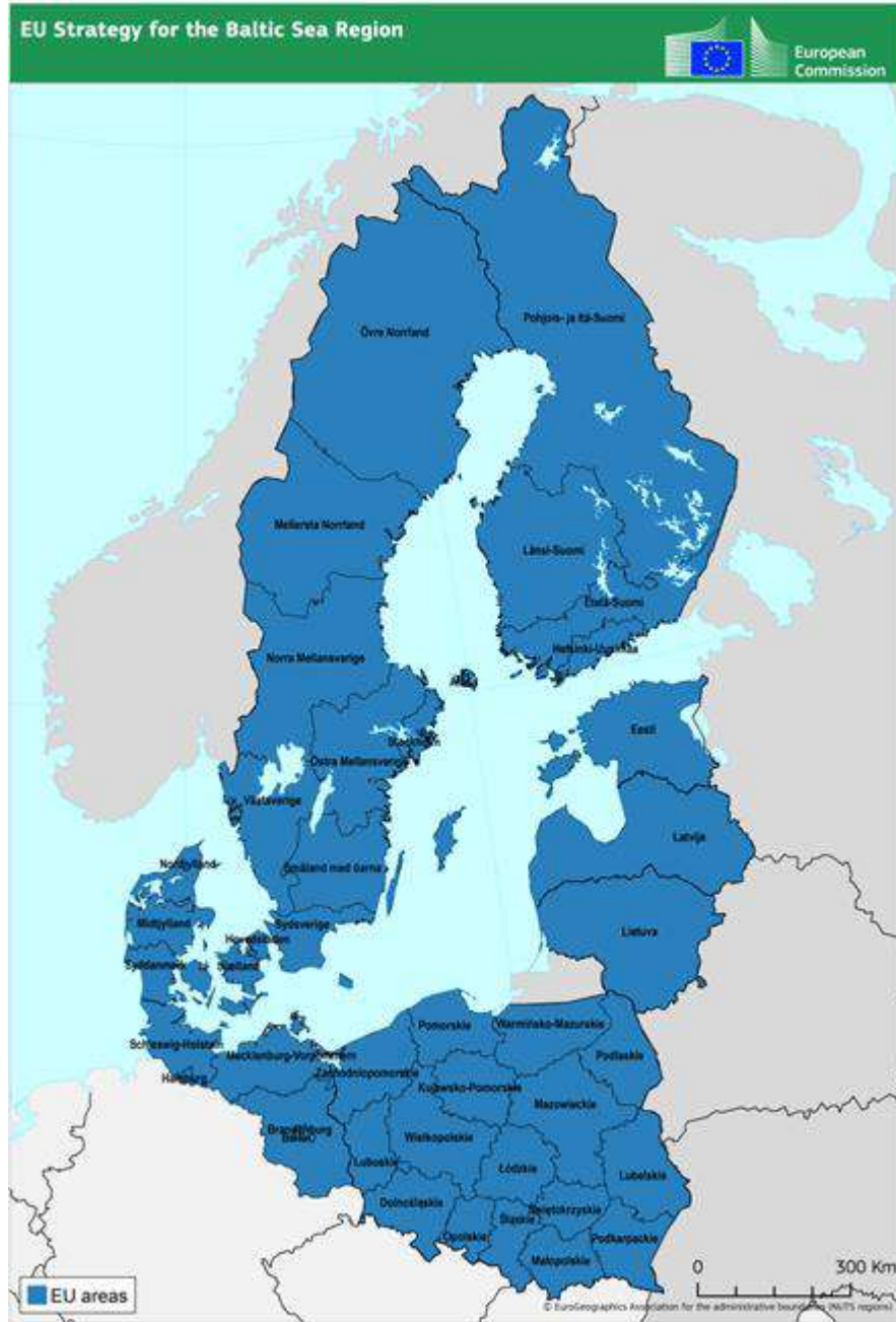
Annex 1: map of the EU Strategy for the Baltic Sea Region